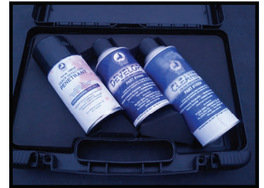
The crack inspection kit.

portant part of the preparation. After all, when you're feeling like the rock on the end of a string going around in circles on a high-speed oval, the last thing you want is for that string to break!