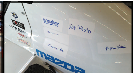
Some of the decals that our VIPs signed to donate to the Justin Wilson Children's Fund and the Challenged Athletes Foundation.