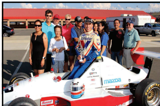
Post race with just a few of our VIPs.

change or rather, delay, that destiny – but of course, there is not. That's been the hardest thing to accept....that a life so giving, so talented, and selfless is no longer with us and there is nothing I can do about it, other than to be grateful to have known him – as brief as it was.