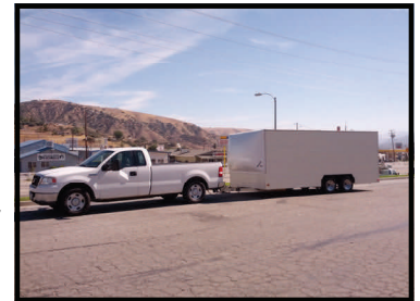
Truck and trailer ready to roll.

road flares/reflective triangles, spare trailer tires and parts must also be at the ready. At the track the unloading is easy, loading back up must be in a sequence to make sure everything is in its place and secured for the trip.