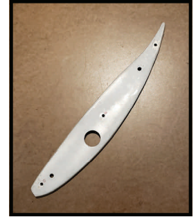
An outer spar that the wing end-plate bolts to.

the wing the proper curves and also have one inch holes to accept the steel tubing. The outer spar also has three specialized threaded inserts that will accept the bolts from the end plates. Altogether there are over six pieces (tabs, Gurney flap, main elements, end plates, tubing and associated hardware) to make one side. These pieces come in bare aluminum from the manufacturer so they must be primed, painted and have decals applied to make a com-